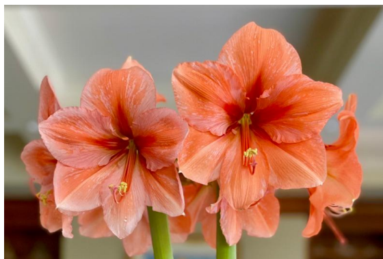
Rilona Amaryllis Botanical Name: Hippeastrum 'Rilona'

Rilona is fast becoming one of my favorites. This one currently has two stalks with ten 6" blooms and an overall width of 16". It was slow to get going but I now know my cold-but-sunniest window sill has kept my bulbs in a slower wake up. But no