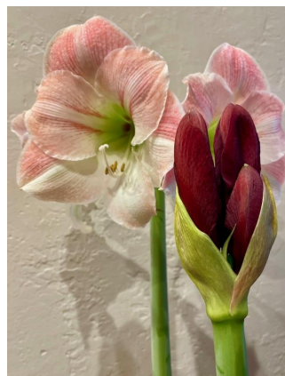
Susan Amaryllis Botanical Name: Hippeastrum