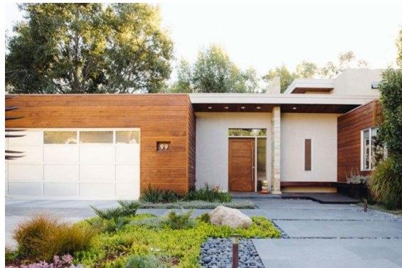
Fire resistant garden.

High Country Gardens suggestions for fire resistant plants and shrubs