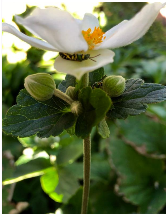
Anemone 'Honorine Jobert' by Suellen White

Conference on January 21, 2021 . The conference will be open to all 18,000 members of GCA clubs, free of charge. Stay tuned for more details and registration information.