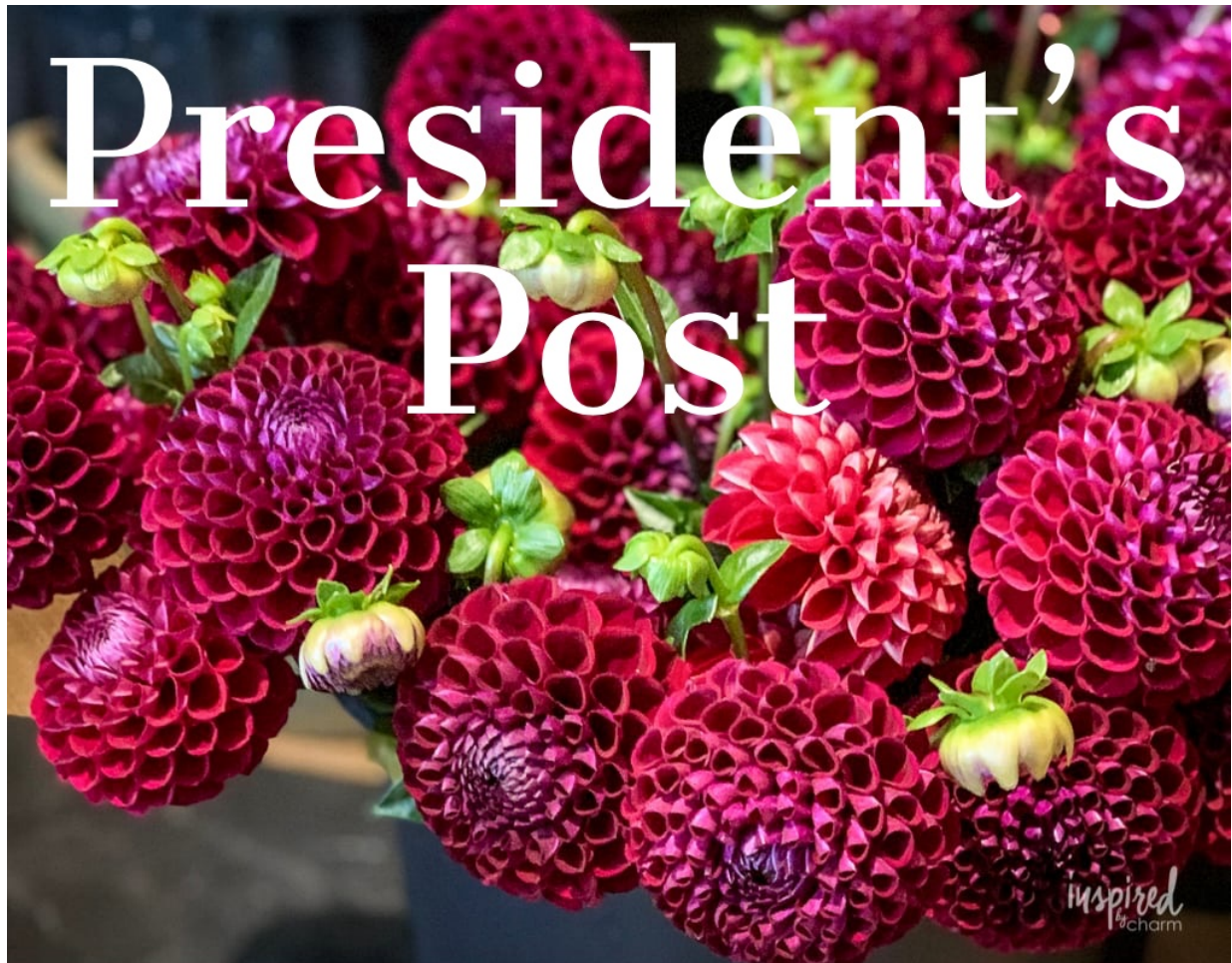
Photo courtesy of Inspiredbycharm.com. Check out their website for tips on planting and growing dahlias

"September is dressing herself in show of dahlias..." Oliver Wendell Holmes