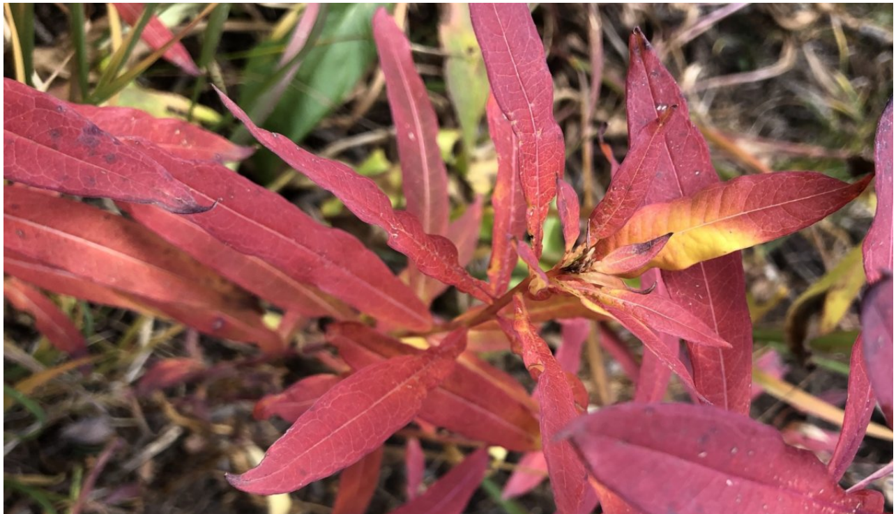
Fireweed, Chamaenerion augustifolium (formerly Epilobium), San Juan Mountains